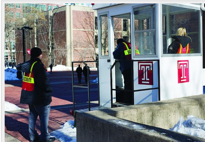
Security boxes, like this one outside Ritter Hall, are an example of security methods CSS takes to keep students safe. Currently, CSS is increasing security surrounding Main Campus.